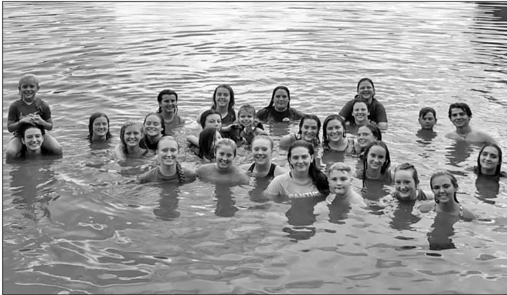
The Lady Panthers have participated in team-building activities throughout the summer. During last week's trip to Carrollton, the team paid a visit to Lake Tisinger in nearby Bowdon. Union visits Franklin County this week for two games before hosting Midnight Madness, a father-daughter game, a movie and a cookout on Friday night.

faced last week was unlike anything Union County has dealt with all summer. Heard County is the defending Class AA State Champion and Central-Carrollton finished as the runner-up in Class AAAAA.