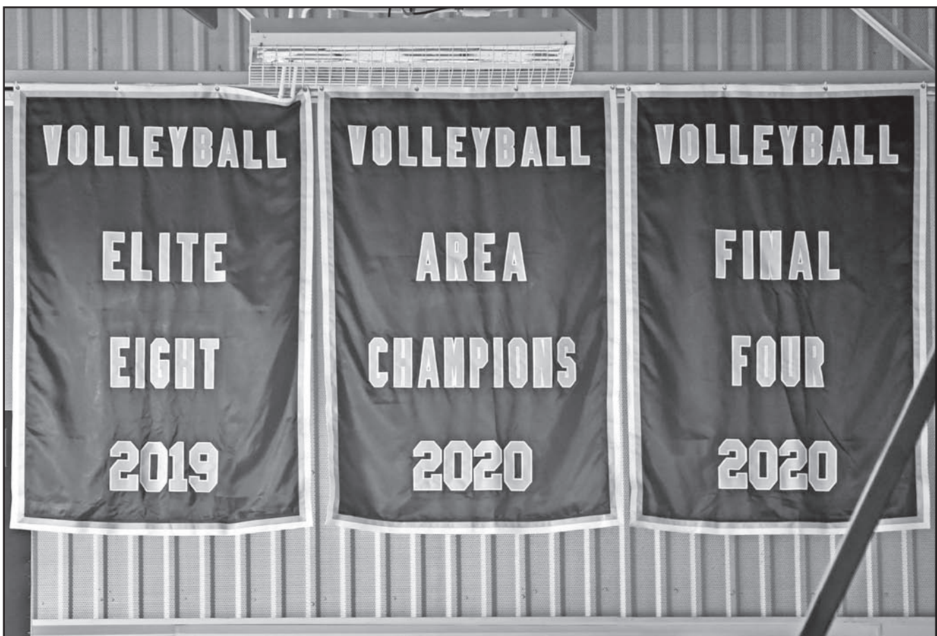
The two newest additions to the gym rafters will immortalize Union County's momentous 2020 volleyball season. Union will be among the favorites to win state in 2021 and will face Class AA/A runner-up Gordon Lee on Sept. 14 in a measuring-stick matchup.